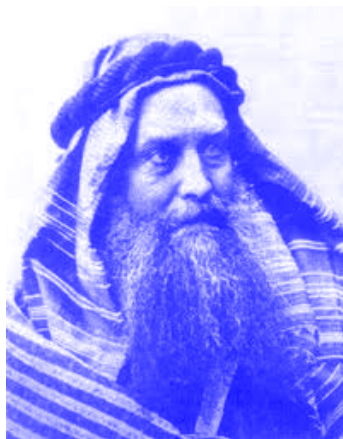
Reverend William Hechler

1896, Hechler showed up unannounced at Herzl’s apartment in Vienna, whose Jewish community was cool, if not hostile, to Zionism. Herzl was suspicious of this man who wanted the Jews to return to Zion and convert to Christianity, until the reverend mentioned he had once tutored the grand duke of Baden, the head of the southwest German state. Hechler tapped his