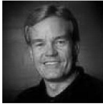
Bill Hybels, Head Pastor

Why the most influential church in America now says: "We made a mistake."